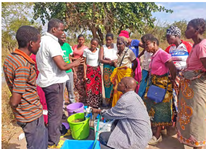
Seed Sowers Trust volunteers demonstrating how to use the Aquabox water filters.

By mid-March the government of Malawi had established 534 camps, to house more than half a million displaced people, and when