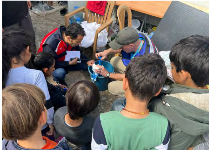
Project Orphan volunteers demonstrate the Aquabox filter.

Subsequently, we established a new partnership with Project Orphan, which has been working through the Turkish Ministry for Families and Social Services (MfFaSS). Project Orphan has been working in Hatay province with lone children and with families who have been displaced or lost their homes following the earthquake.