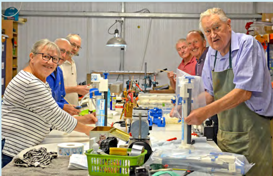
Volunteer filter assemblers - aiming to double production.